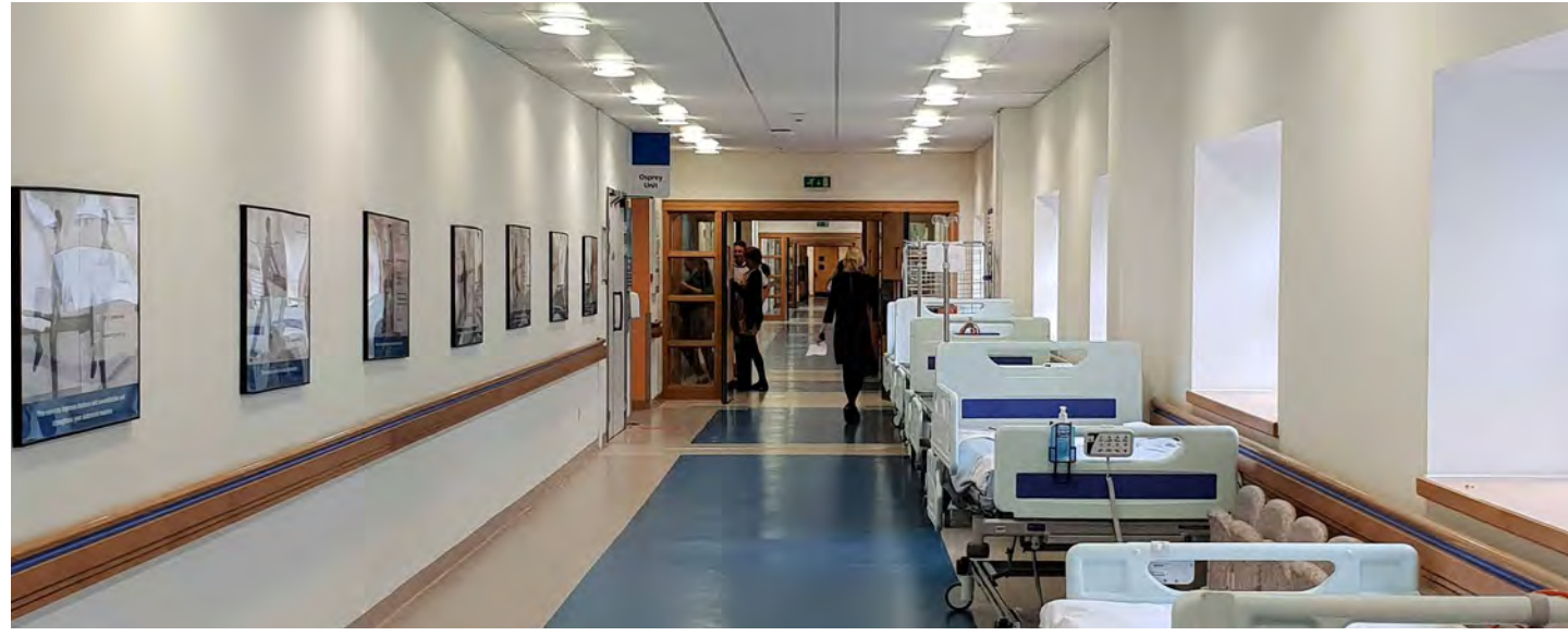
Thousands of NHS beds have been closed or left empty – as private hospitals cash in on the pandemic

NHS funded patients because these are more profitable.